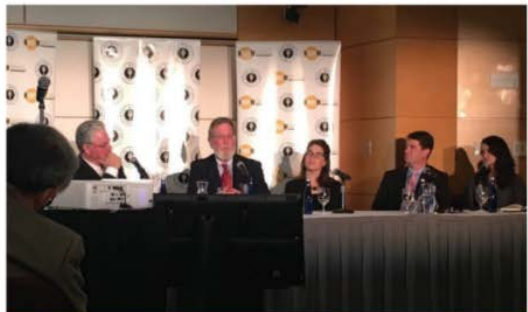
LIGHTest at the KINO/W Conference in Washington

the world to present LIGHTest at conferences and events. In May, OIX and USTUTT presented LIGHTest in the context of identity frameworks and how these interoperate for seamless customer experiences, at the first KINO/W Conference in Washington. This was followed by the second International Identity Management Law and Policy meeting co-hosted by the OIX and the World Bank. At this event, OIX presented LIGHTest in the context of trust frameworks and standards, with USTUTT introducing LIGHTest to this group of influential, global policy and legal decision makers from both the public and private sector.